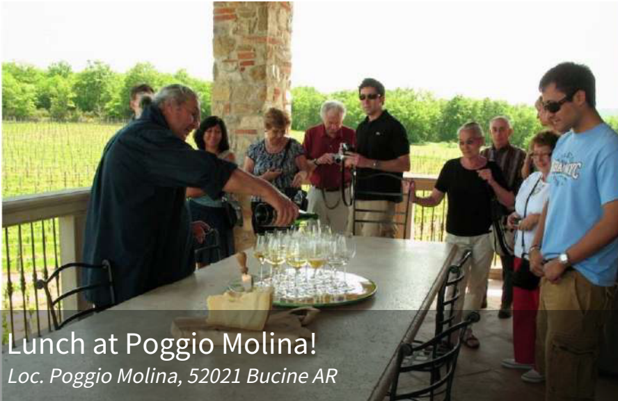
Lunch at Poggio Molina! Loc. Poggio Molina, 52021 Bucine AR